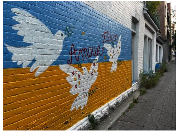
Mural in Montreal, Canada