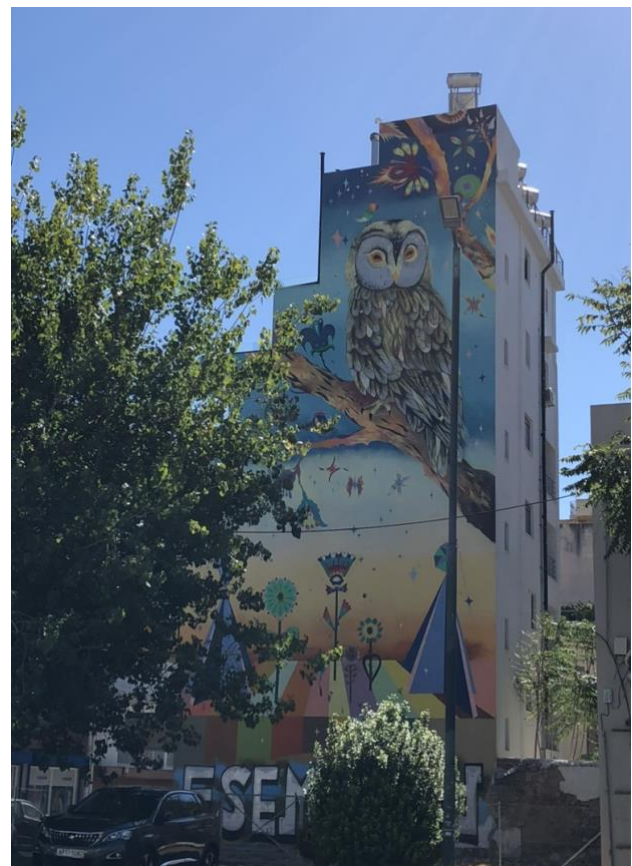
Owl Mural, Kerameikos region

"You opened our eyes..." quote, on-line participant.