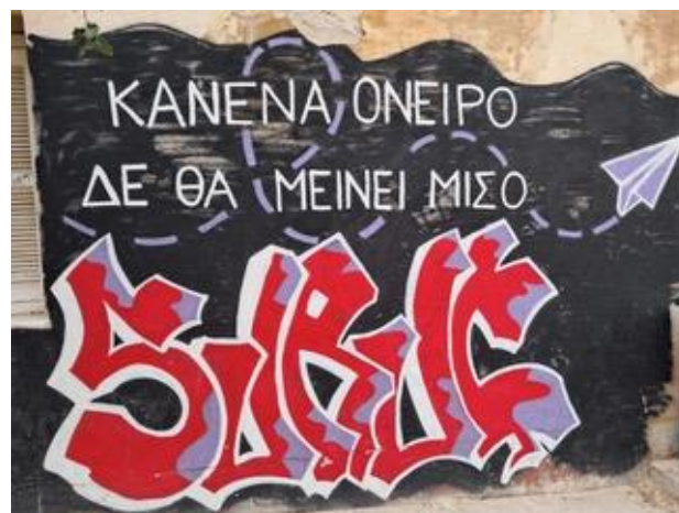
"No Dream should remain half-fulfilled"

Assistant Professor of Aesthetics, Free University of Bozen-Bolzano