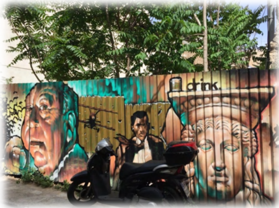
(Top) Streetart in the Koukaki area near the Acropolis.