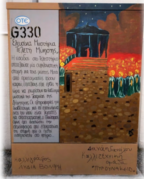
(Bottom) Metal box ("Kafao" ΚΑΦΑΟ) in Elefsina for the European Capital of Culture...