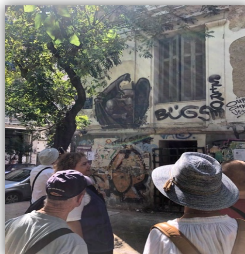
Educational walk w/Human Links, Koukaki area, Athens